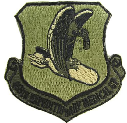
455th Expeditionary Medical GP

The Vulgar Vulture has lived on in Air Force lore and exists even today. The 455th Bombardment Group (Heavy) was deactivated in September 1945 as one of the last Groups to leave Italy after the war. Since then it has been at various times the 455th Bombardment Group (Very Heavy), the 455th Fighter-Day Group, the 455th Fighter-Bomber Wing, the 455th Strategic Missile Wing, the 455th Air Expeditionary Group, and finally the 455th Air Expeditionary Wing, stationed at Bagram Air Base in Afghanistan.”