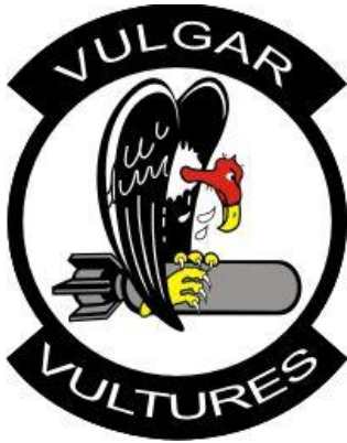
740 th Missile Squadron Decal