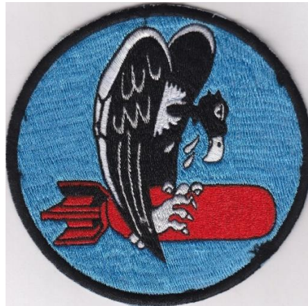
743 rd Squadron Decal